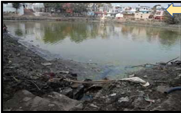
Kankali Talab Before Treatment.