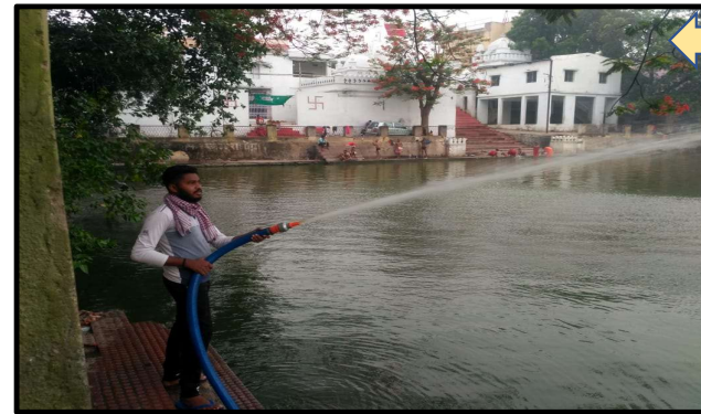
Kankali Talab during Treatment (dosing)