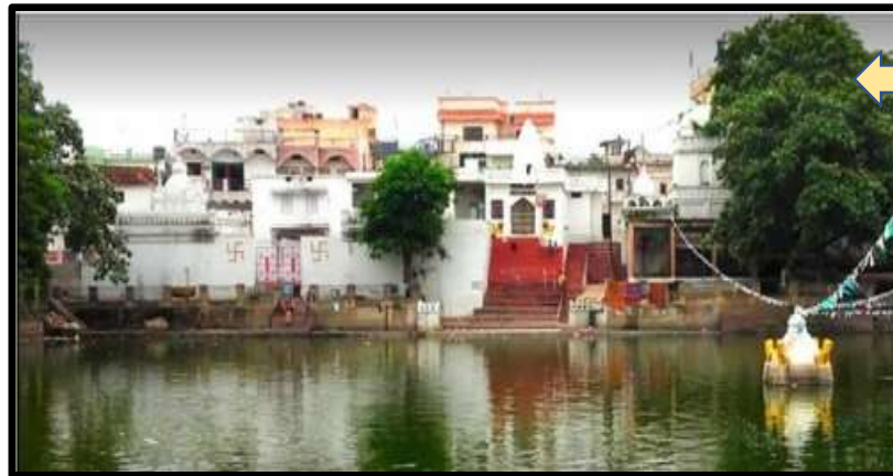
Kankali Talab after Treatment.